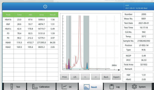
Example of normal sample chromatogram - Thalassemia Mode

The system produces a detailed analysis of each Hb fraction in 380 seconds .